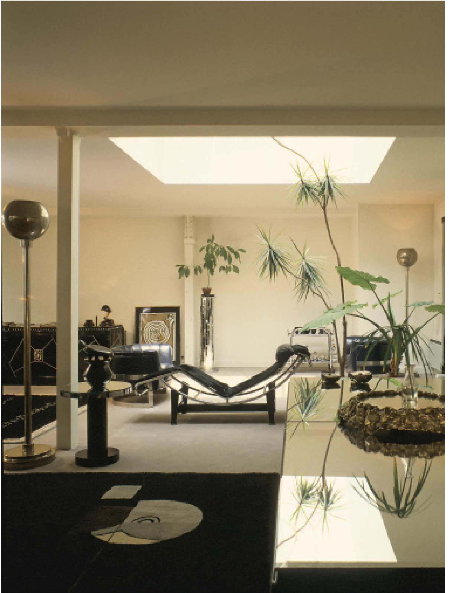
EILEEN GRAY (1879 - 1976)