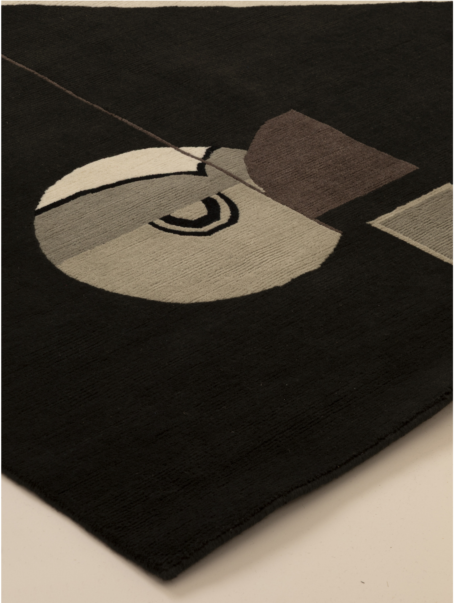
EILEEN GRAY (1879 - 1976)