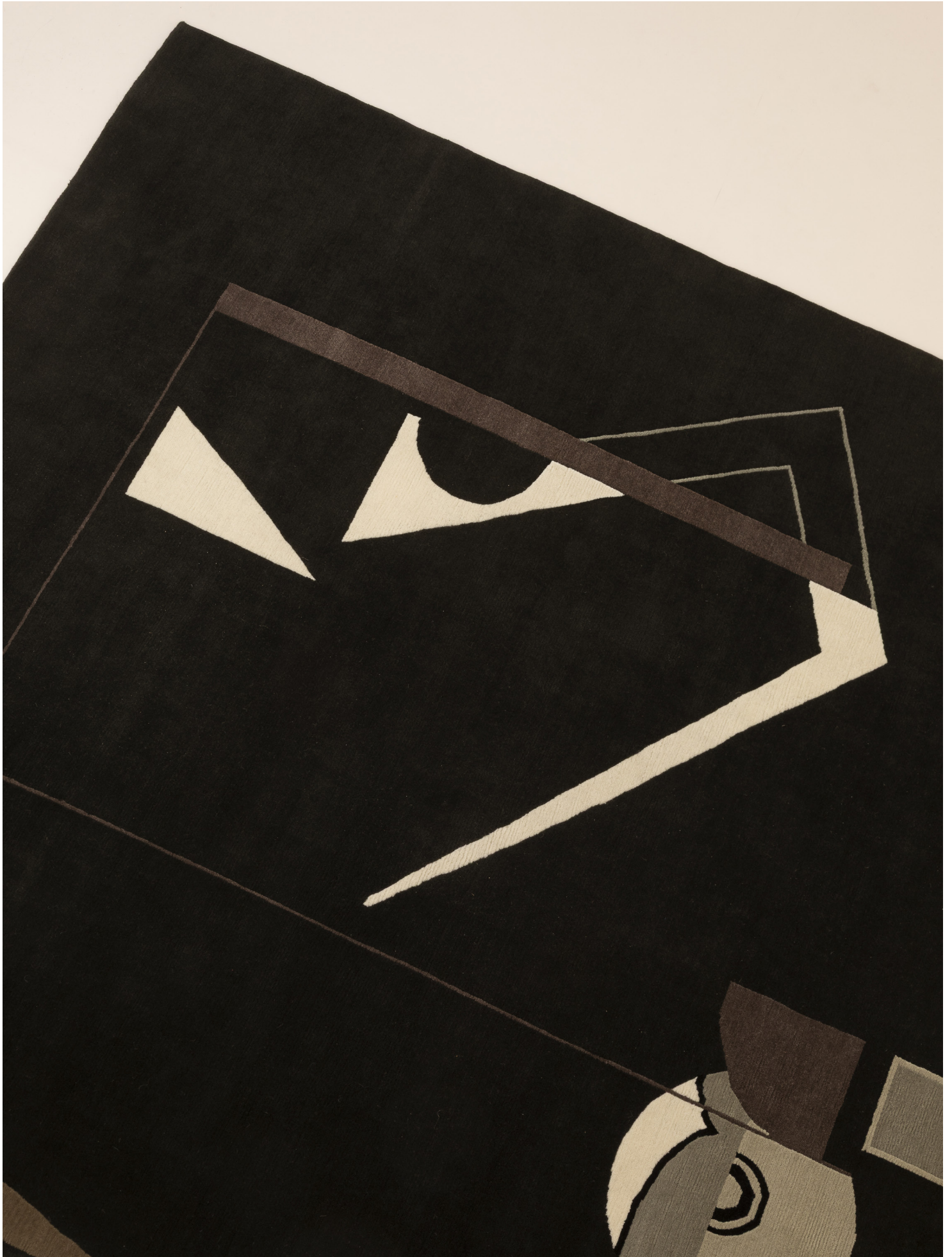
EILEEN GRAY (1879 - 1976)