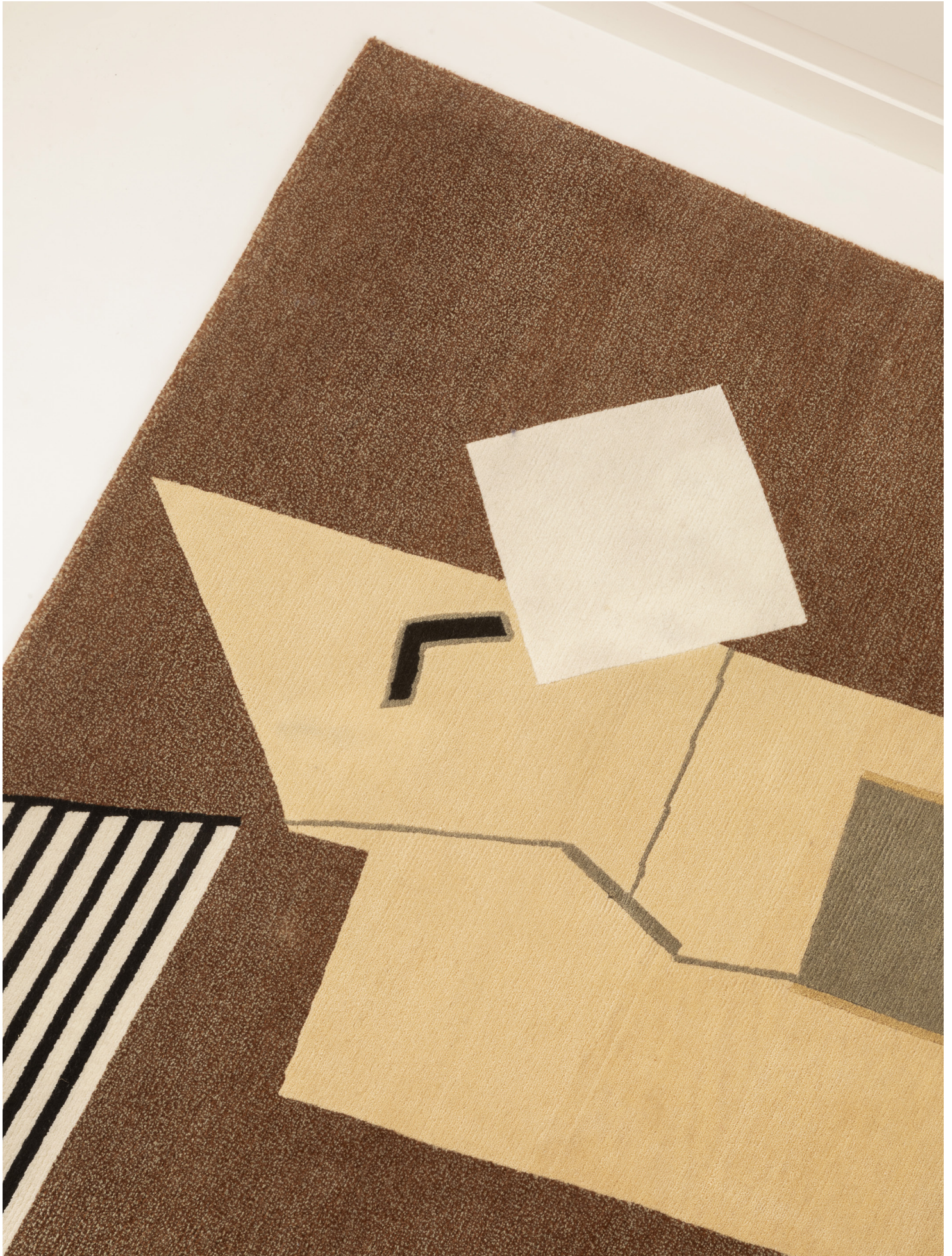
EILEEN GRAY (1879 - 1976)