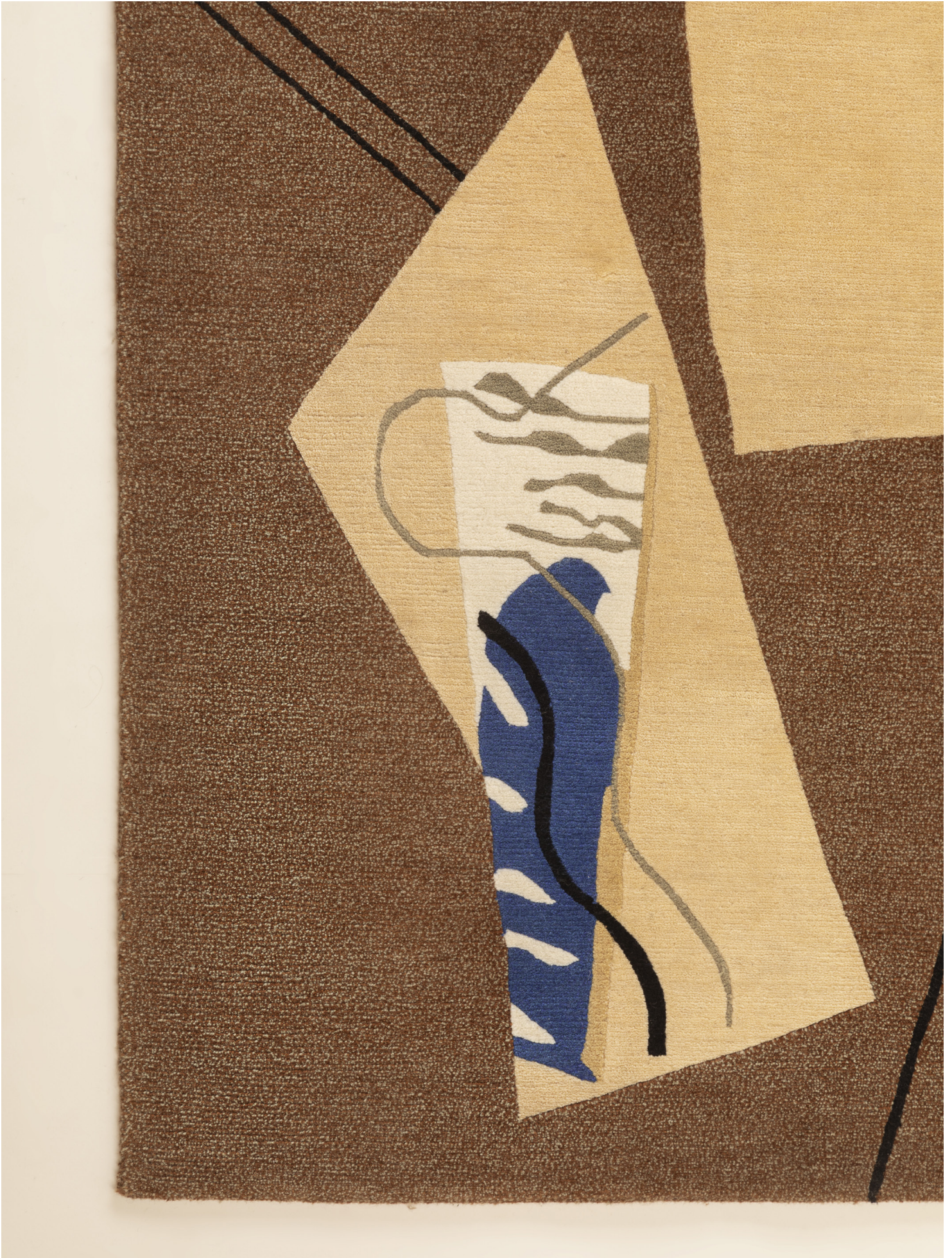
EILEEN GRAY (1879 - 1976)