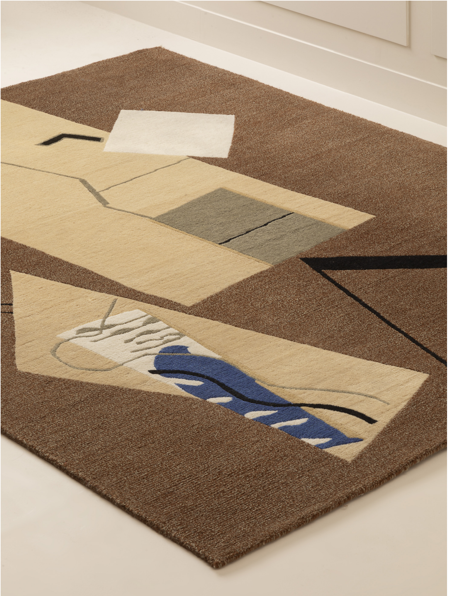
EILEEN GRAY (1879 - 1976)