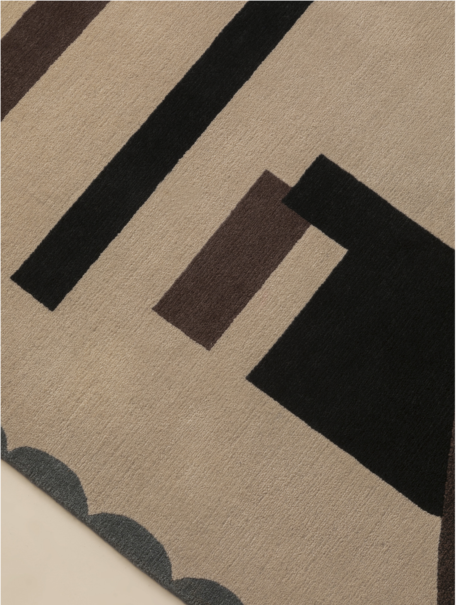
EILEEN GRAY (1879 - 1976)