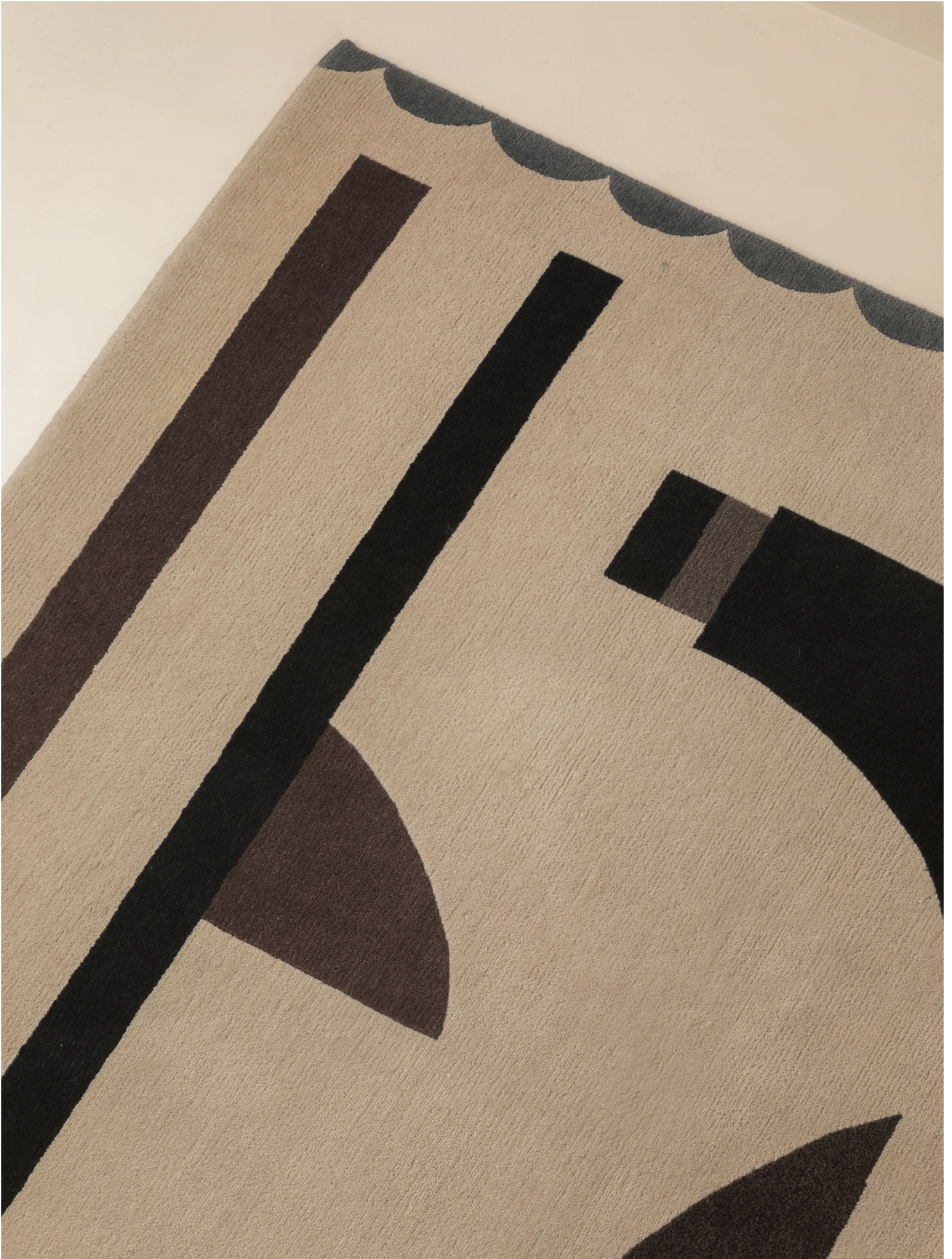
EILEEN GRAY (1879 - 1976)