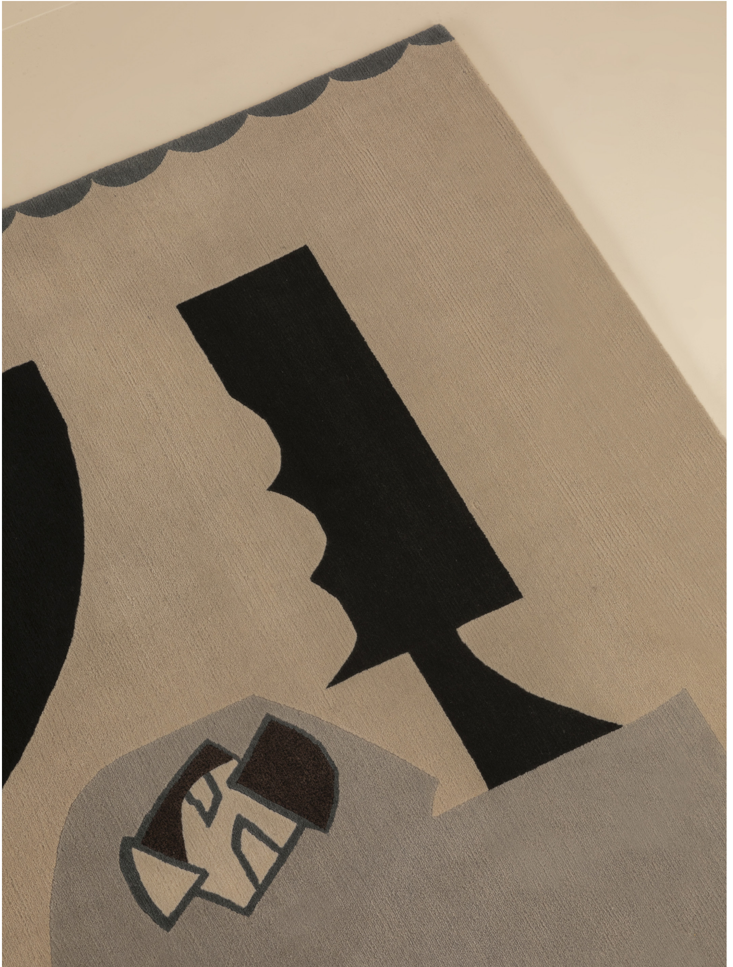
EILEEN GRAY (1879 - 1976)