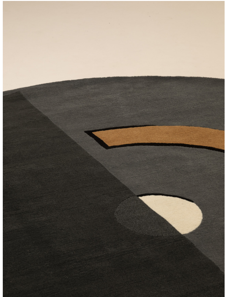
EILEEN GRAY (1879 - 1976)