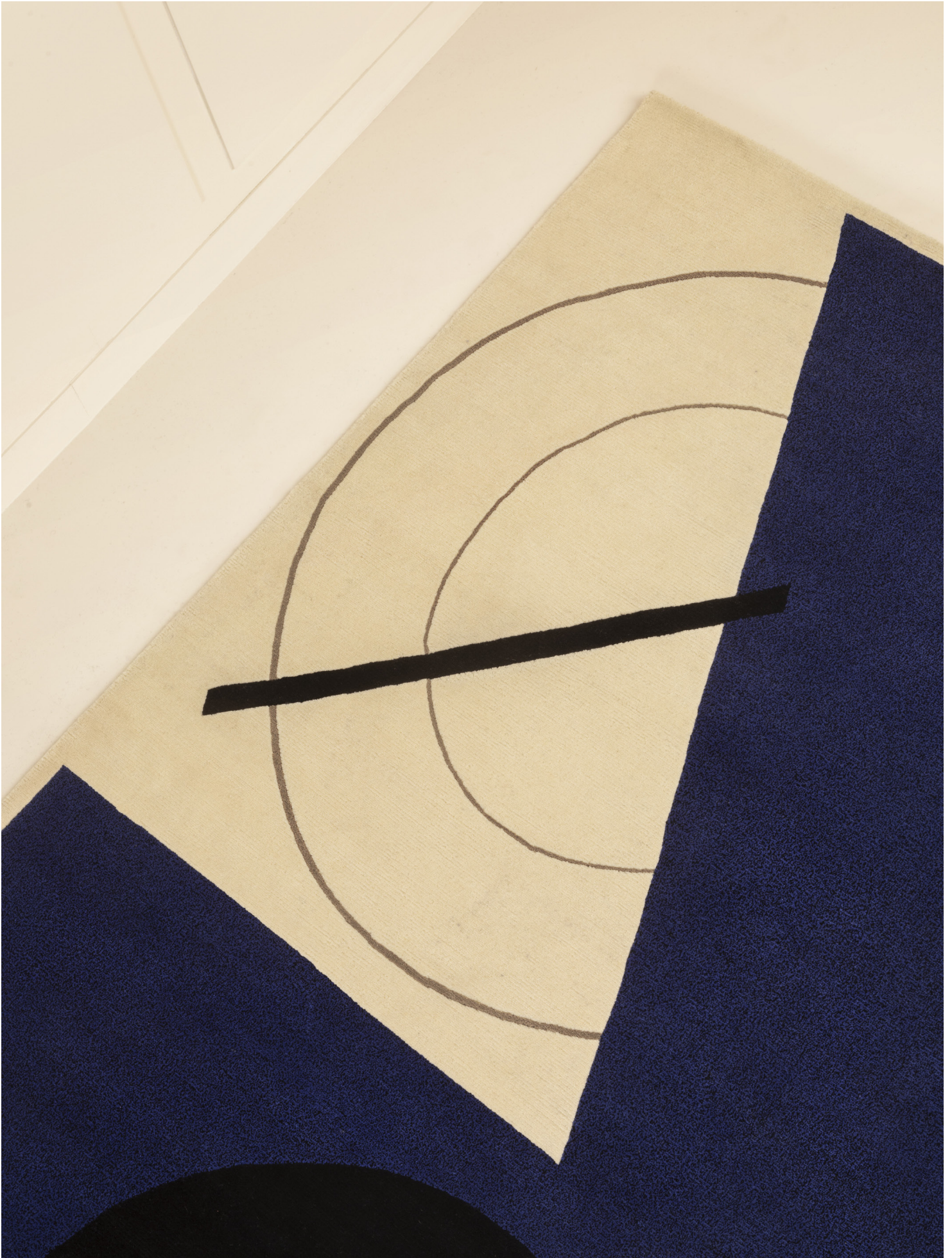
EILEEN GRAY (1879 - 1976)