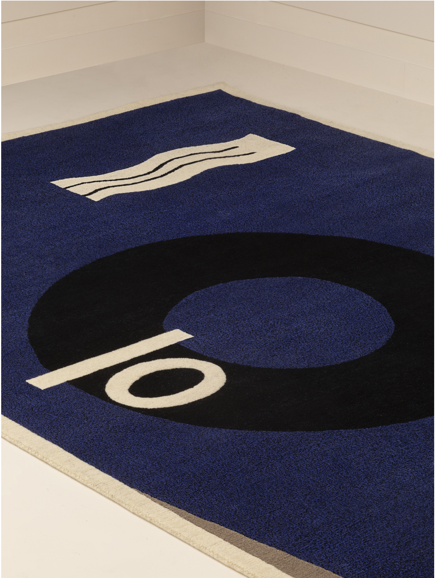
EILEEN GRAY (1879 - 1976)