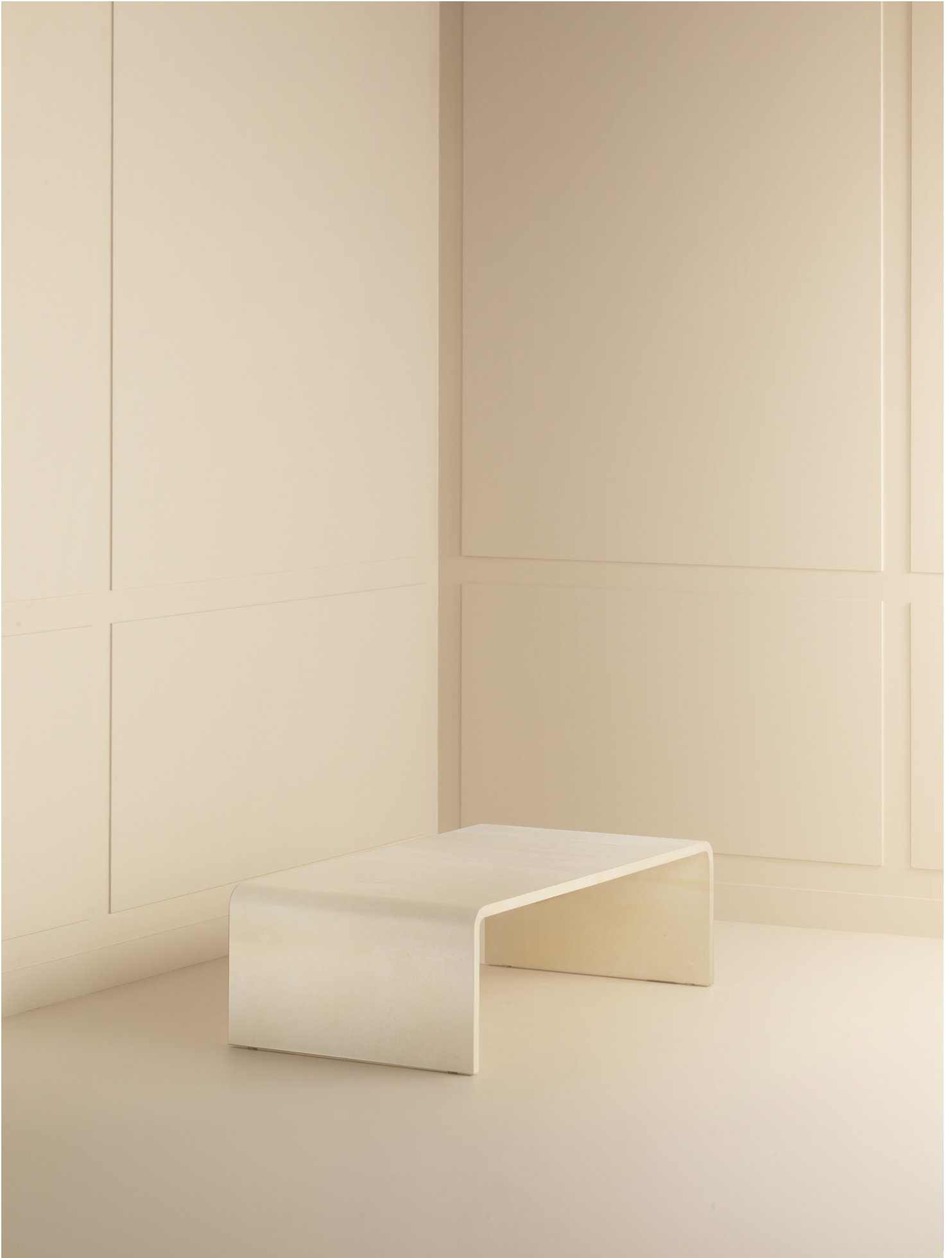
JEAN-MICHEL FRANK (1895-1941)