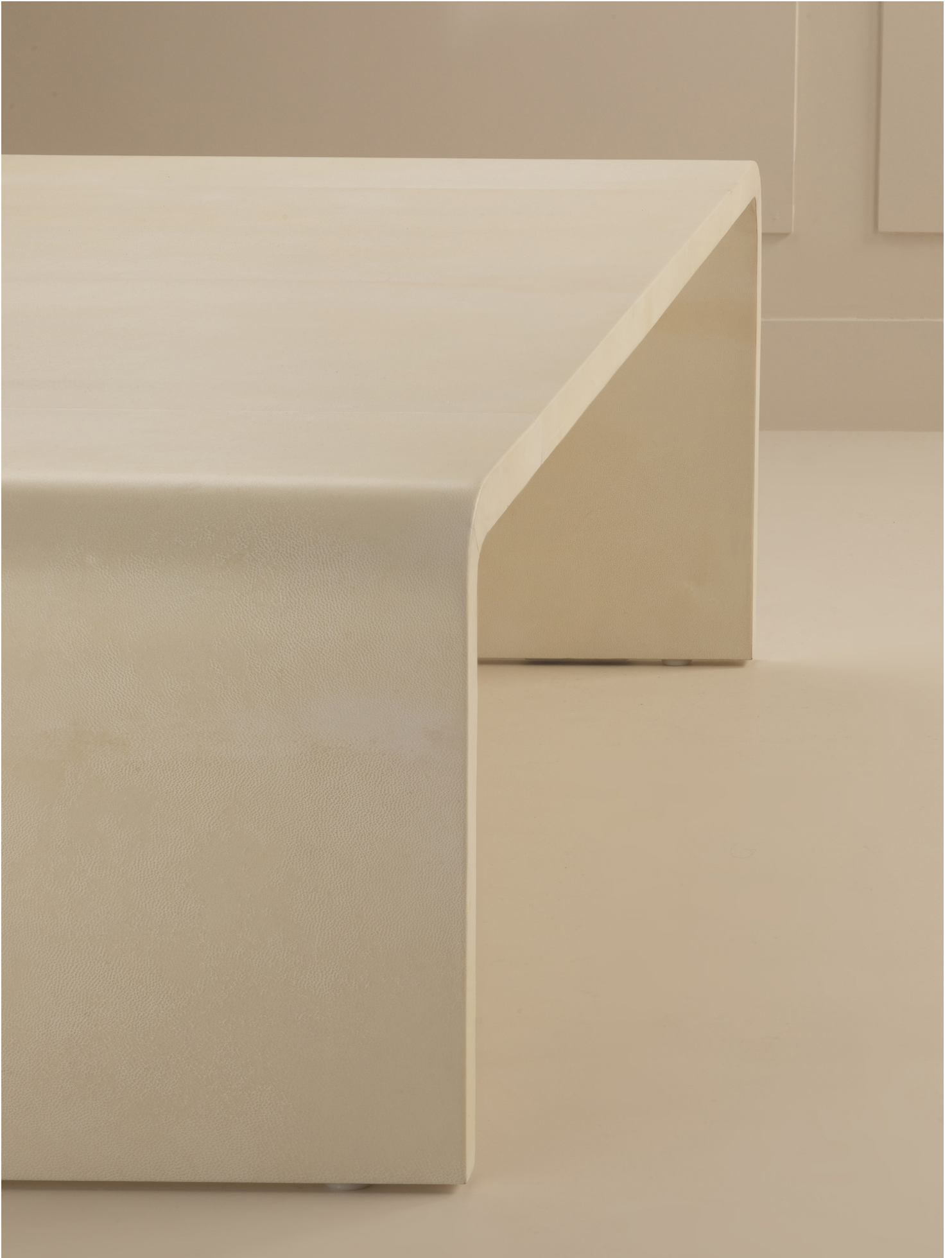
JEAN-MICHEL FRANK (1895-1941)