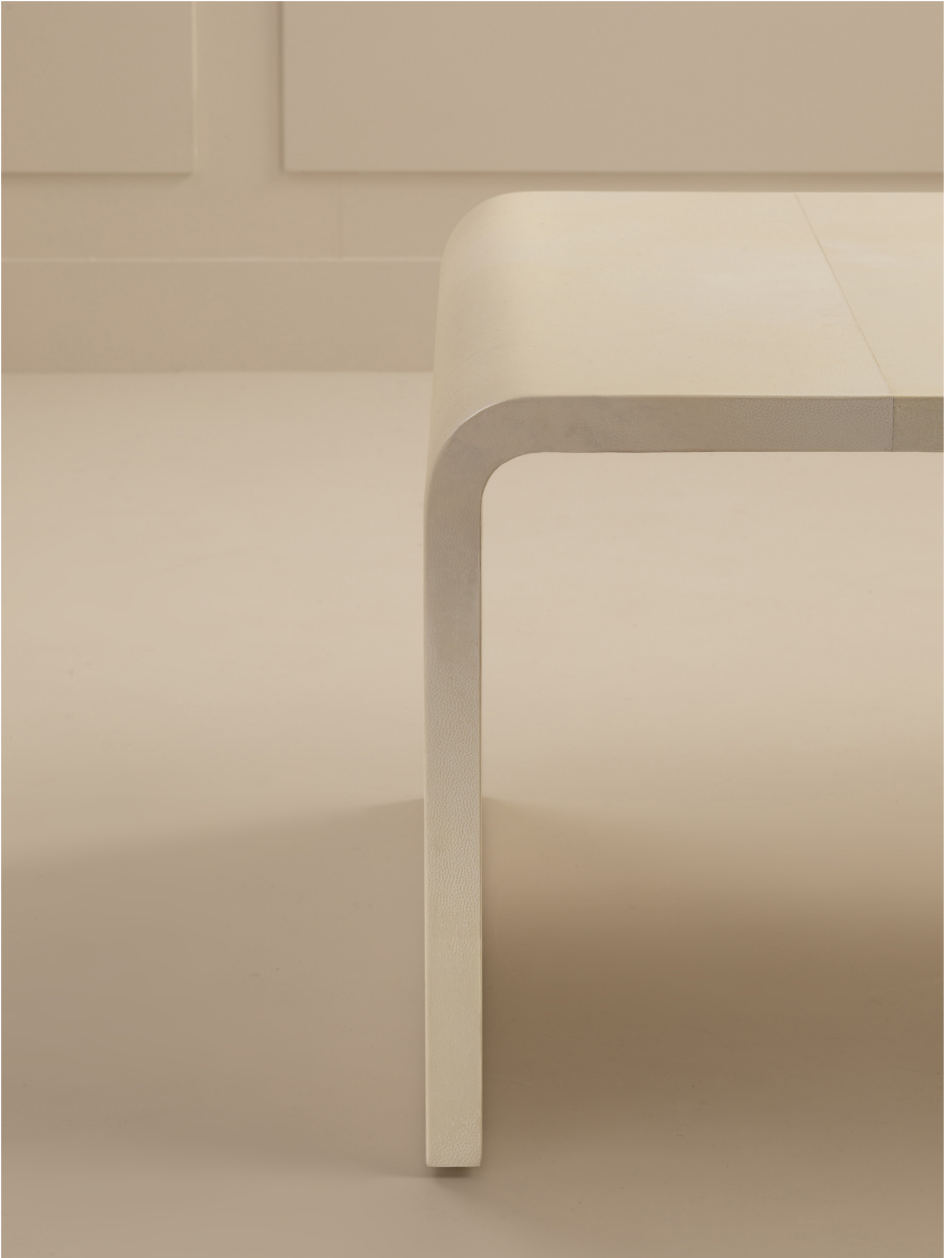
JEAN-MICHEL FRANK (1895-1941)