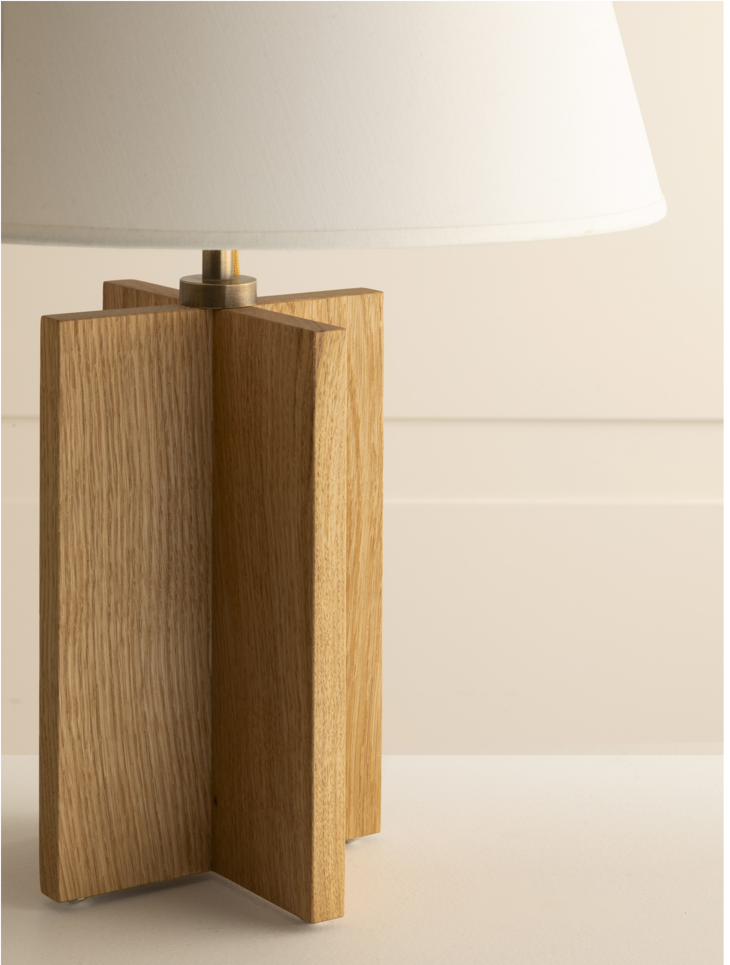
JEAN-MICHEL FRANK (1895-1941)