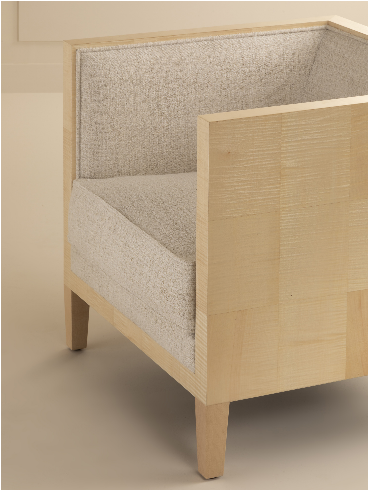
JEAN-MICHEL FRANK (1895-1941)