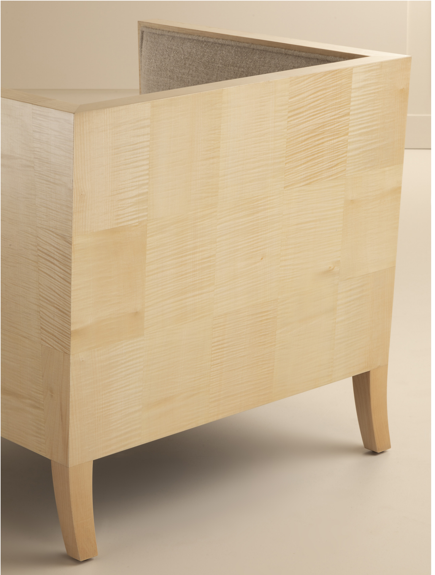
JEAN-MICHEL FRANK (1895-1941)