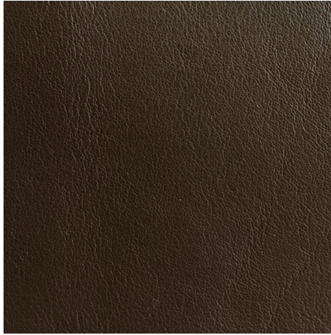
Dark chocolate leather