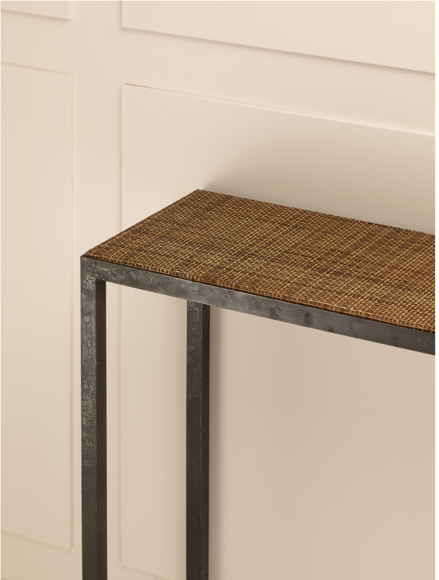
JEAN-MICHEL FRANK (1895-1941)