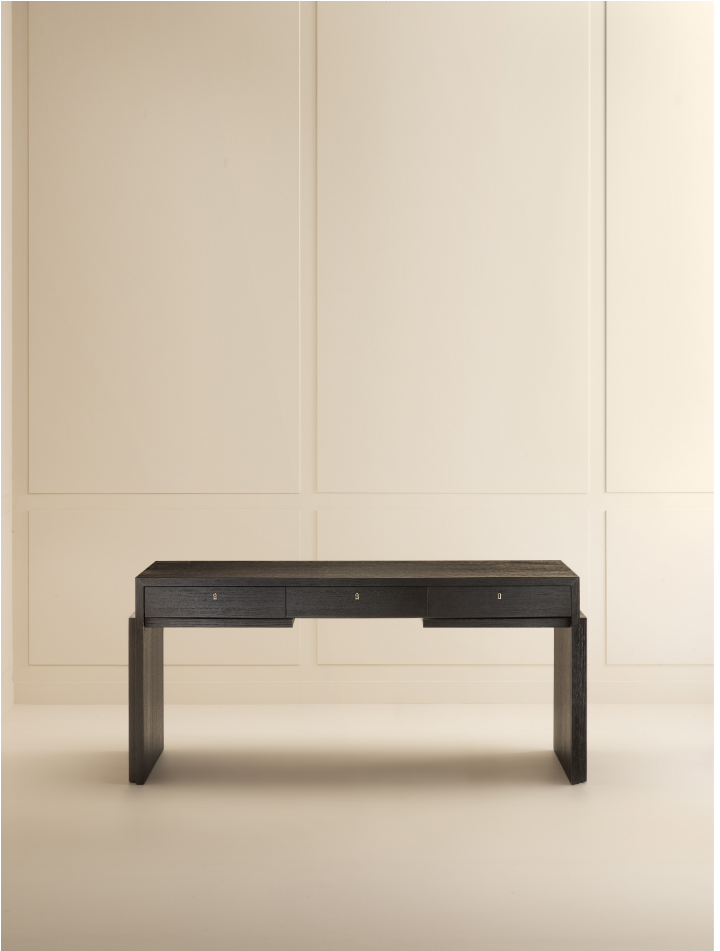
JEAN-MICHEL FRANK (1895-1941)