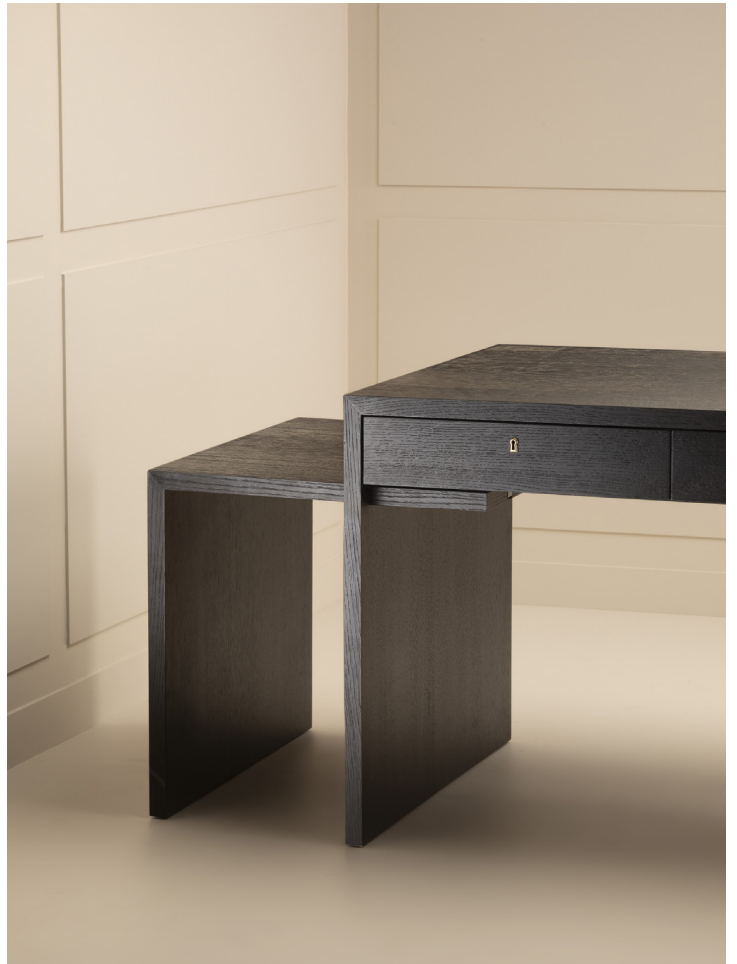
JEAN-MICHEL FRANK (1895-1941)