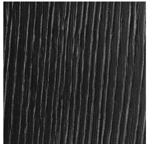
Sandblasted black oak with matte varnish