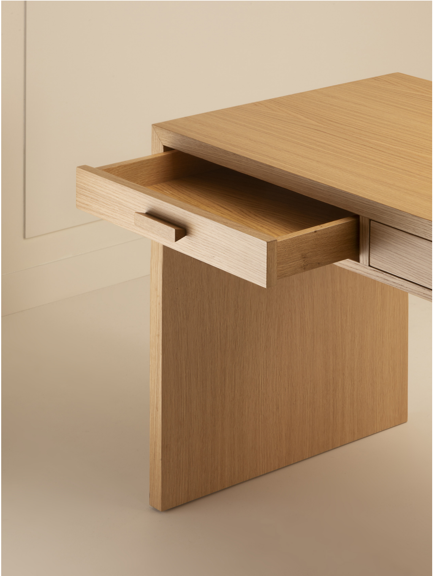
JEAN-MICHEL FRANK (1895-1941)