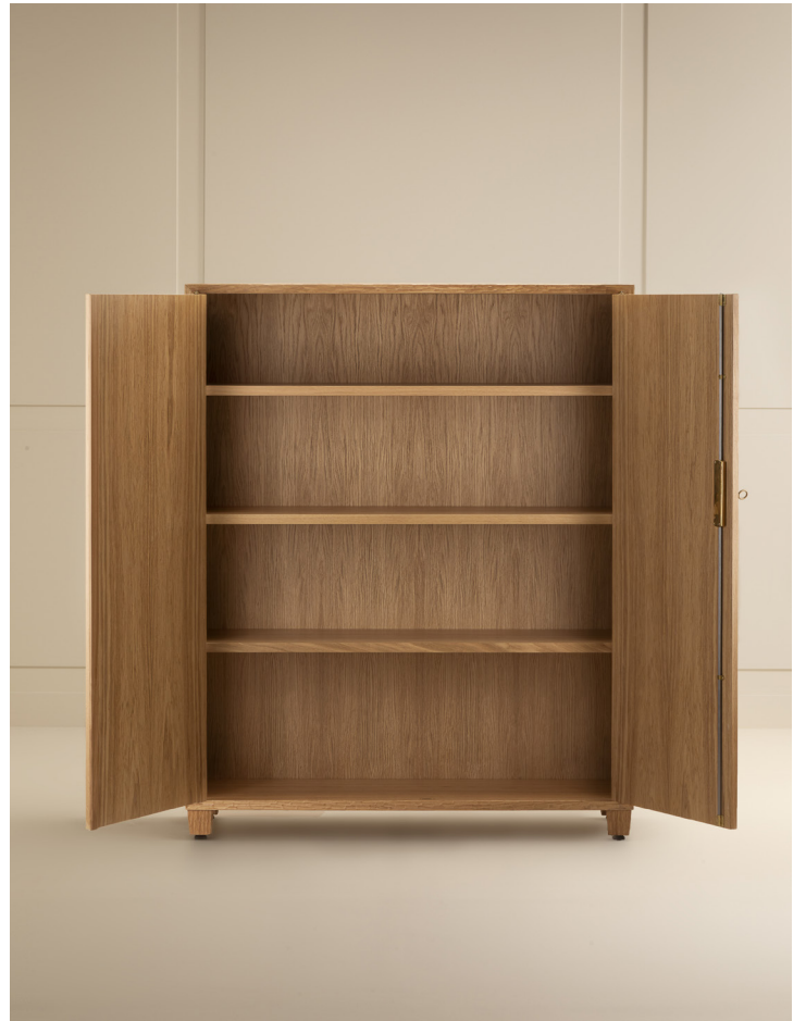
JEAN-MICHEL FRANK (1895-1941)