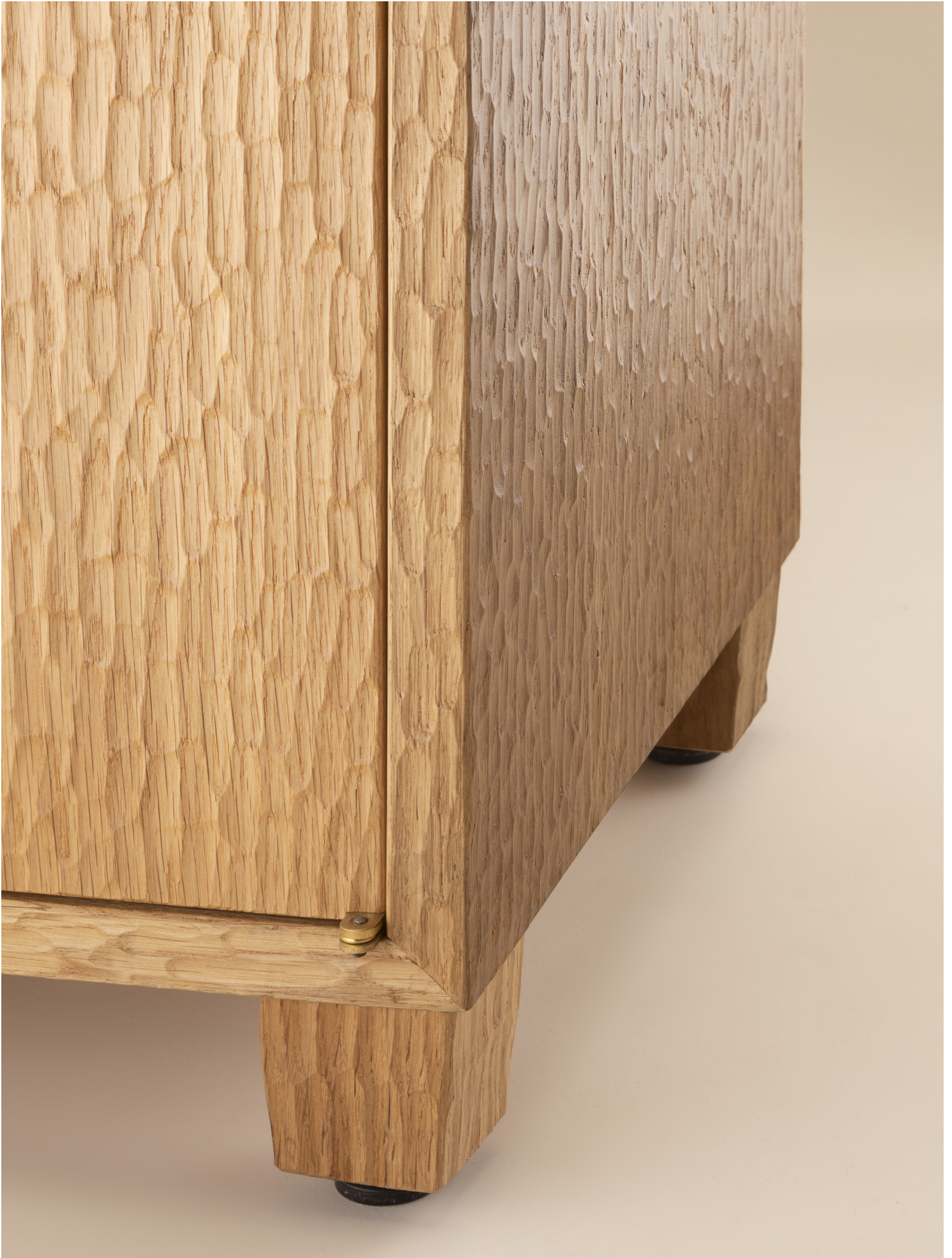
JEAN-MICHEL FRANK (1895-1941)