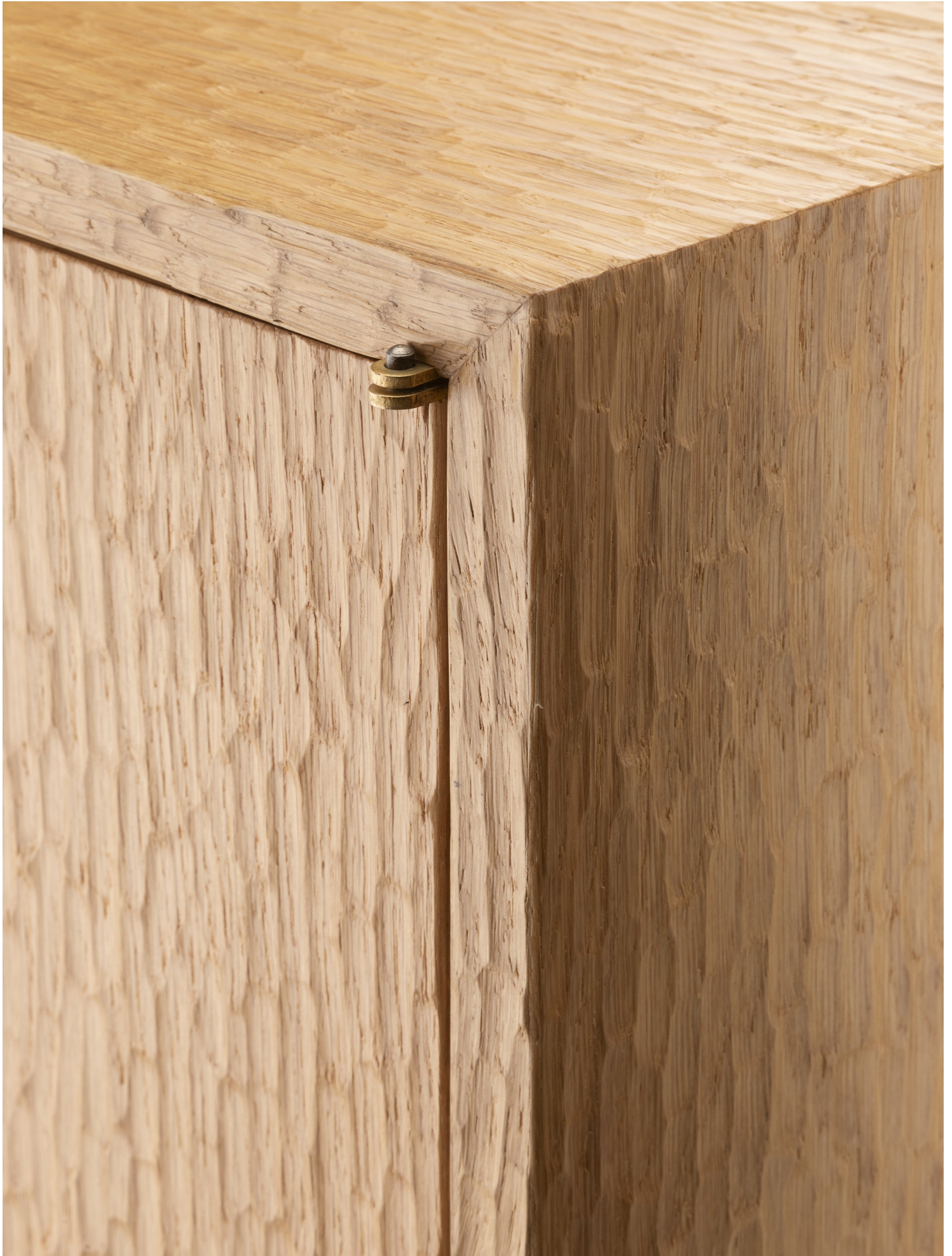
JEAN-MICHEL FRANK (1895-1941)