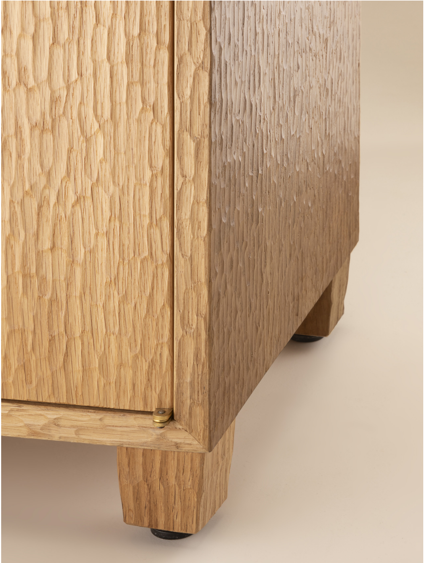
JEAN-MICHEL FRANK (1895-1941)