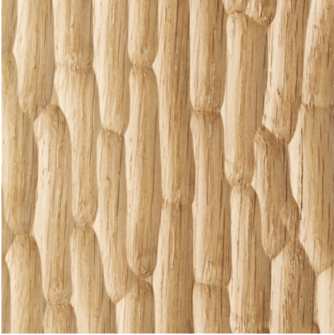
Natural gouged oak with matte varnish