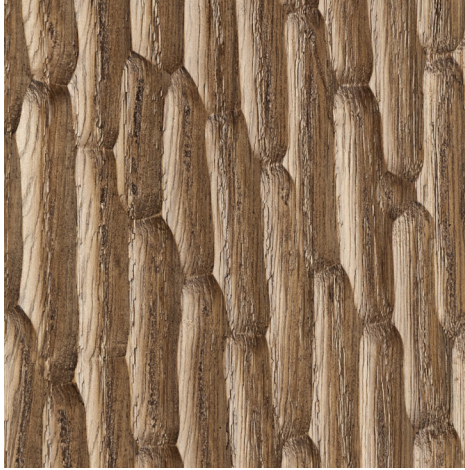
Brown gouged oak with matte varnish