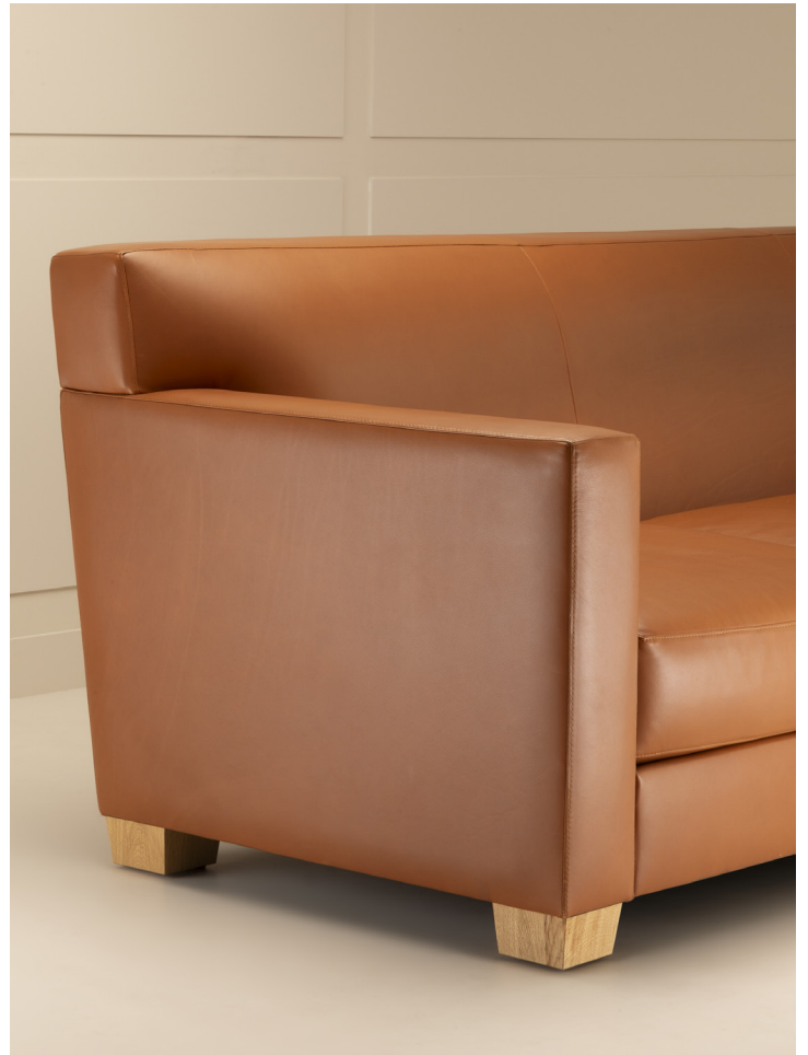
JEAN-MICHEL FRANK (1895-1941)