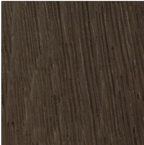
Deep sandblasted brown oak with matte varnish