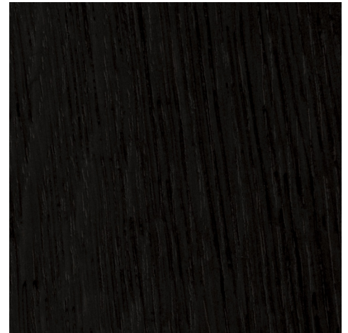
Deep sandblasted black oak with matte varnish