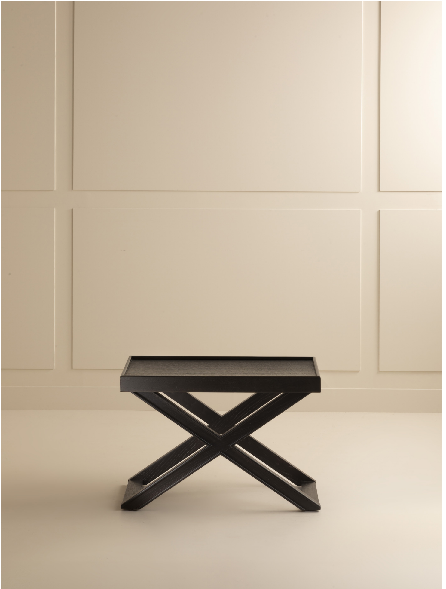
JEAN-MICHEL FRANK (1895-1941)