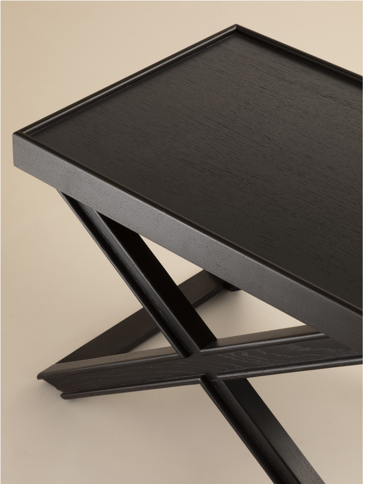
JEAN-MICHEL FRANK (1895-1941)