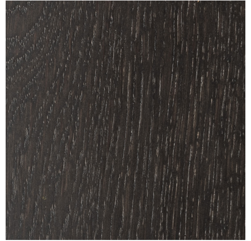
Smooth black oak with matte varnish