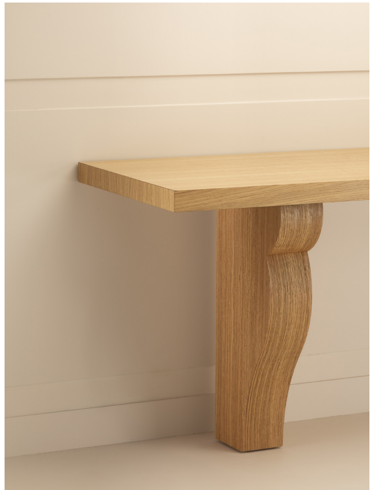
JEAN-MICHEL FRANK (1895-1941)