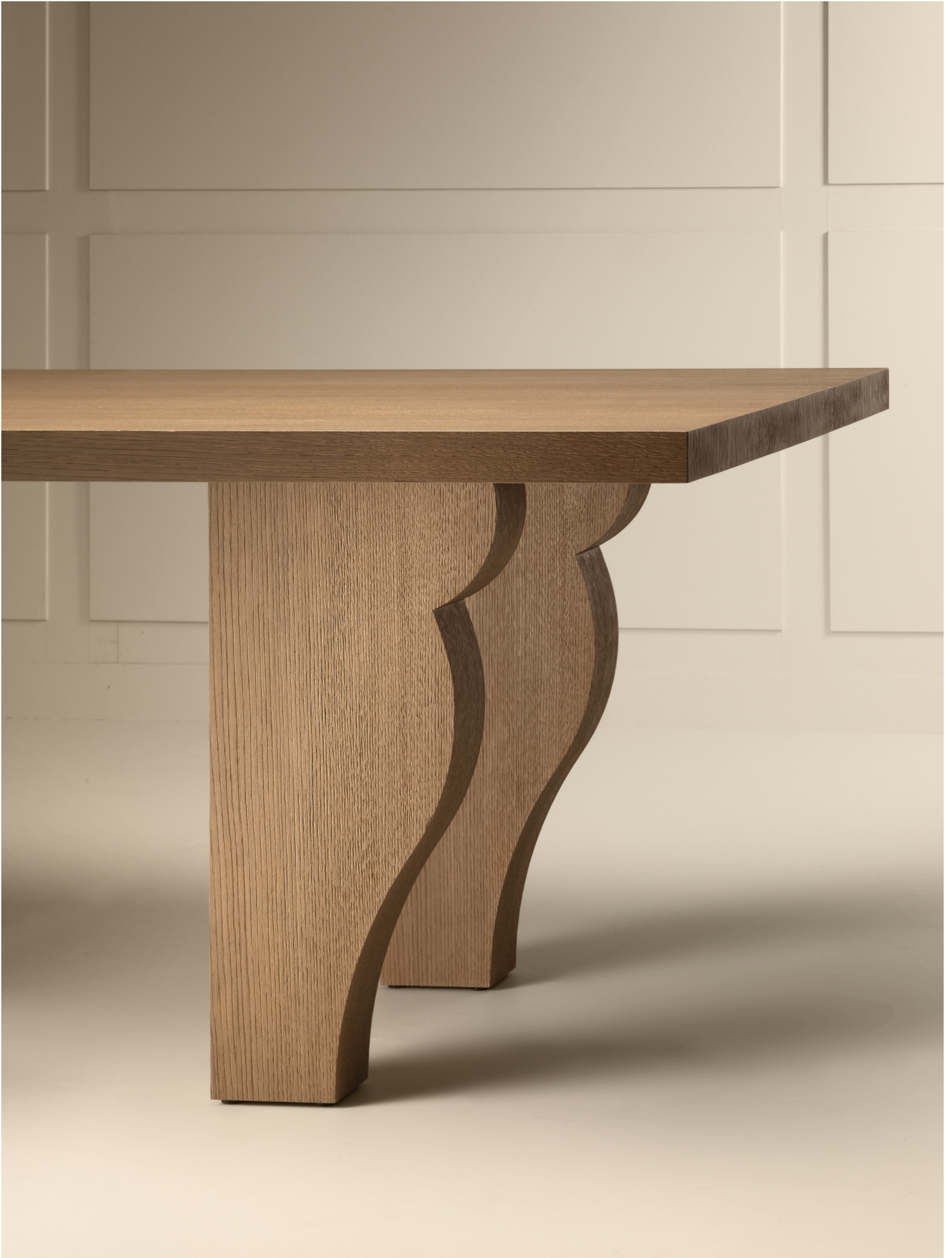
JEAN-MICHEL FRANK (1895-1941)