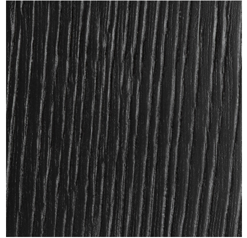
Sandblasted black oak with matte varnish