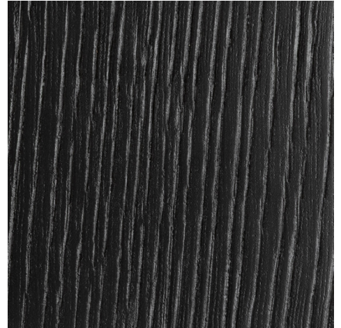
Sandblasted black oak with matte varnish