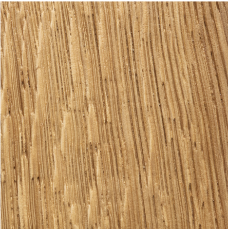
Deep sandblasted natural oak with matte varnish