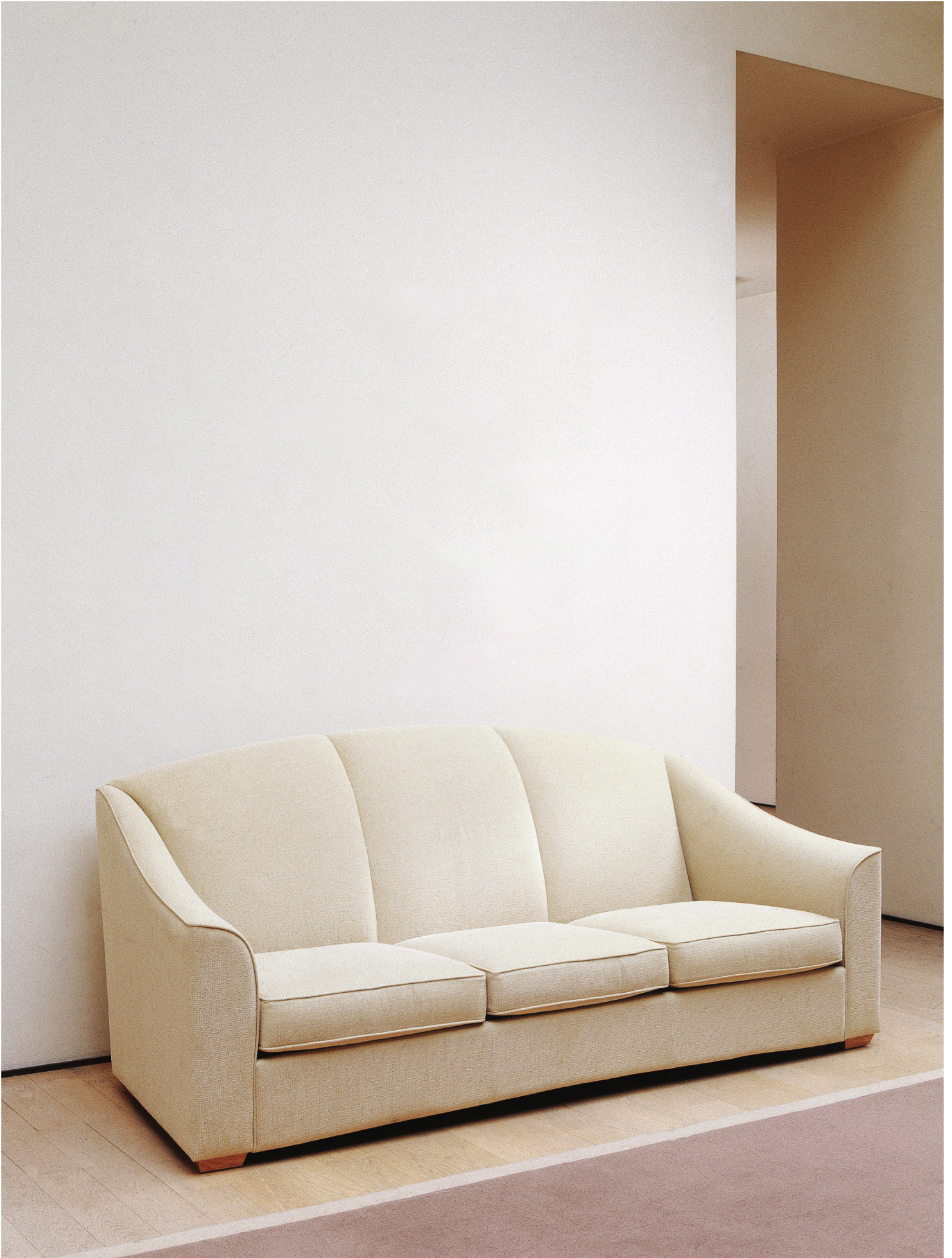
JEAN-MICHEL FRANK (1895-1941)