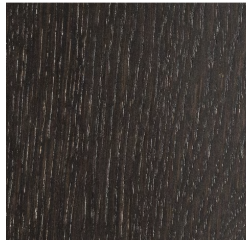
Smooth black oak with matte finish