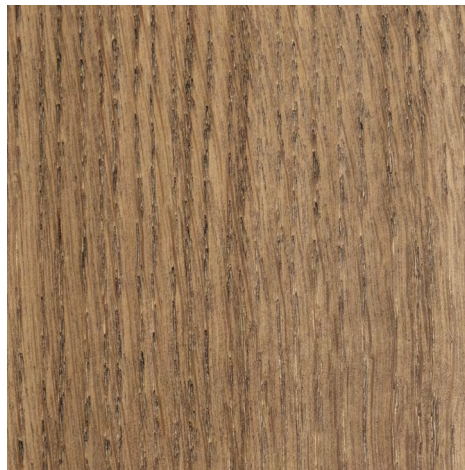
Smooth brown oak with matte finish