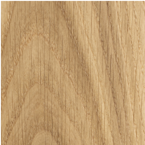
Smooth natural oak with matte varnish