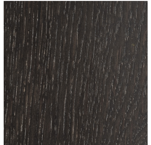
Smooth black oak with matte varnish