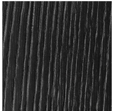
Sandblasted black oak with matte varnish