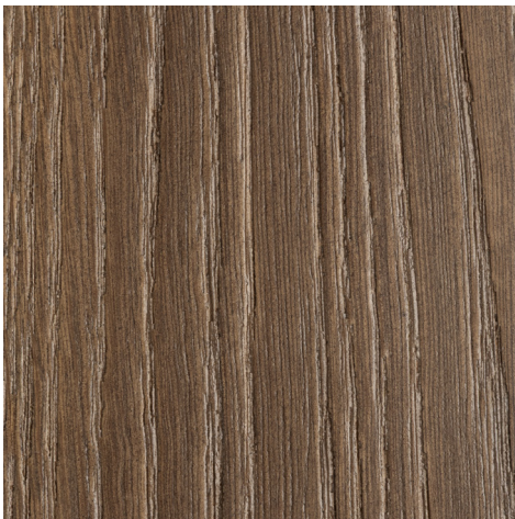
Sandblasted brown oak with matte varnish