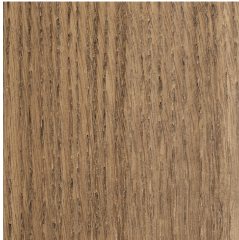
Smooth brown oak with matte varnish