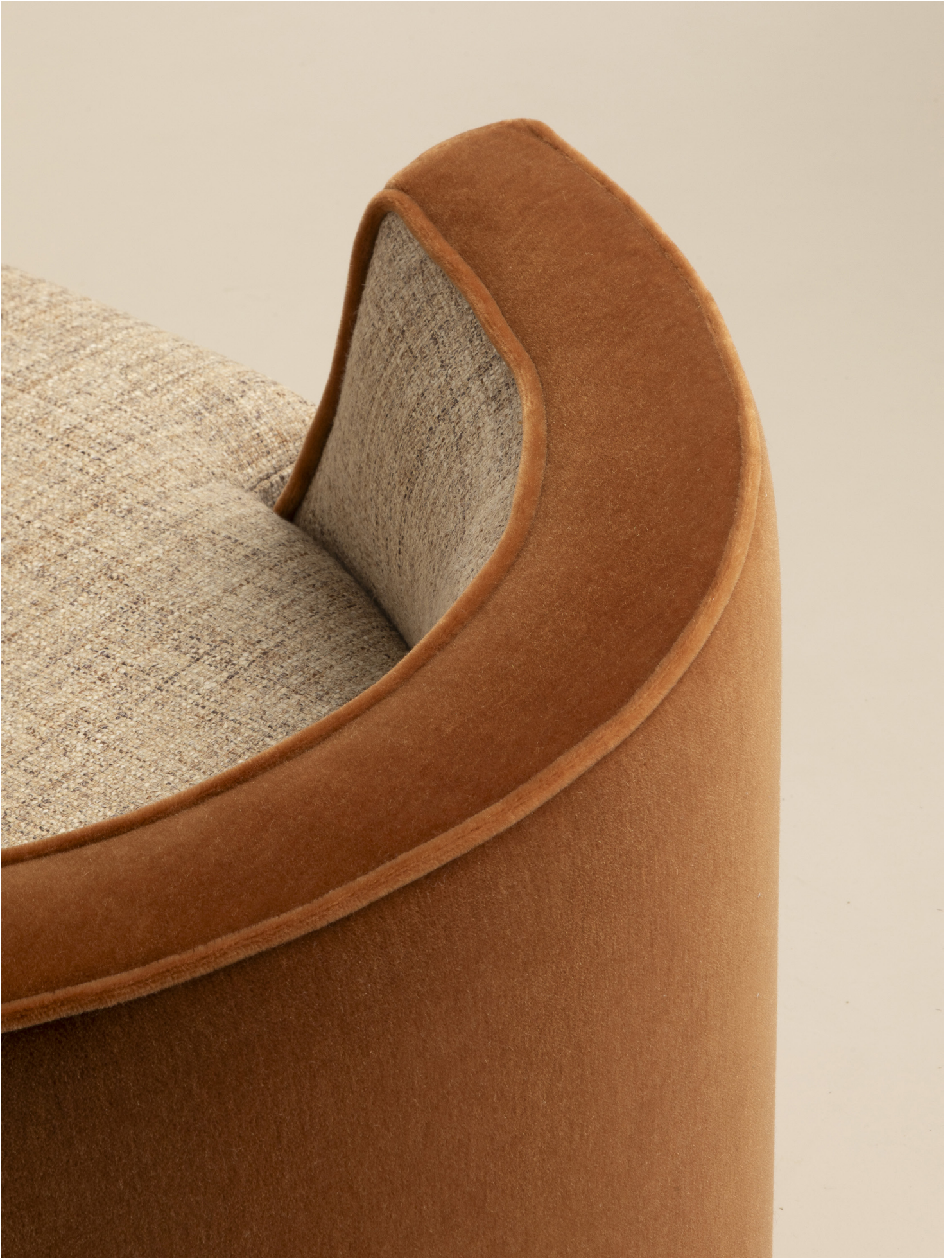
PIERRE CHAREAU (1888-1950)