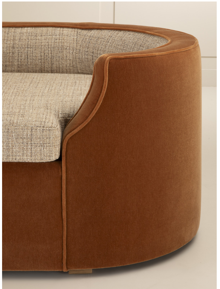
PIERRE CHAREAU (1888-1950)