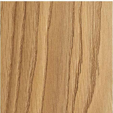
Sandblasted natural oak with matte varnish