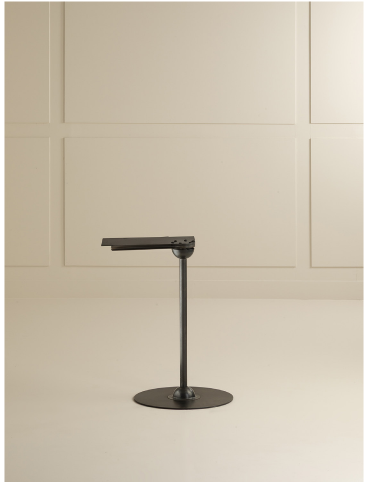
PIERRE CHAREAU (1888-1950)