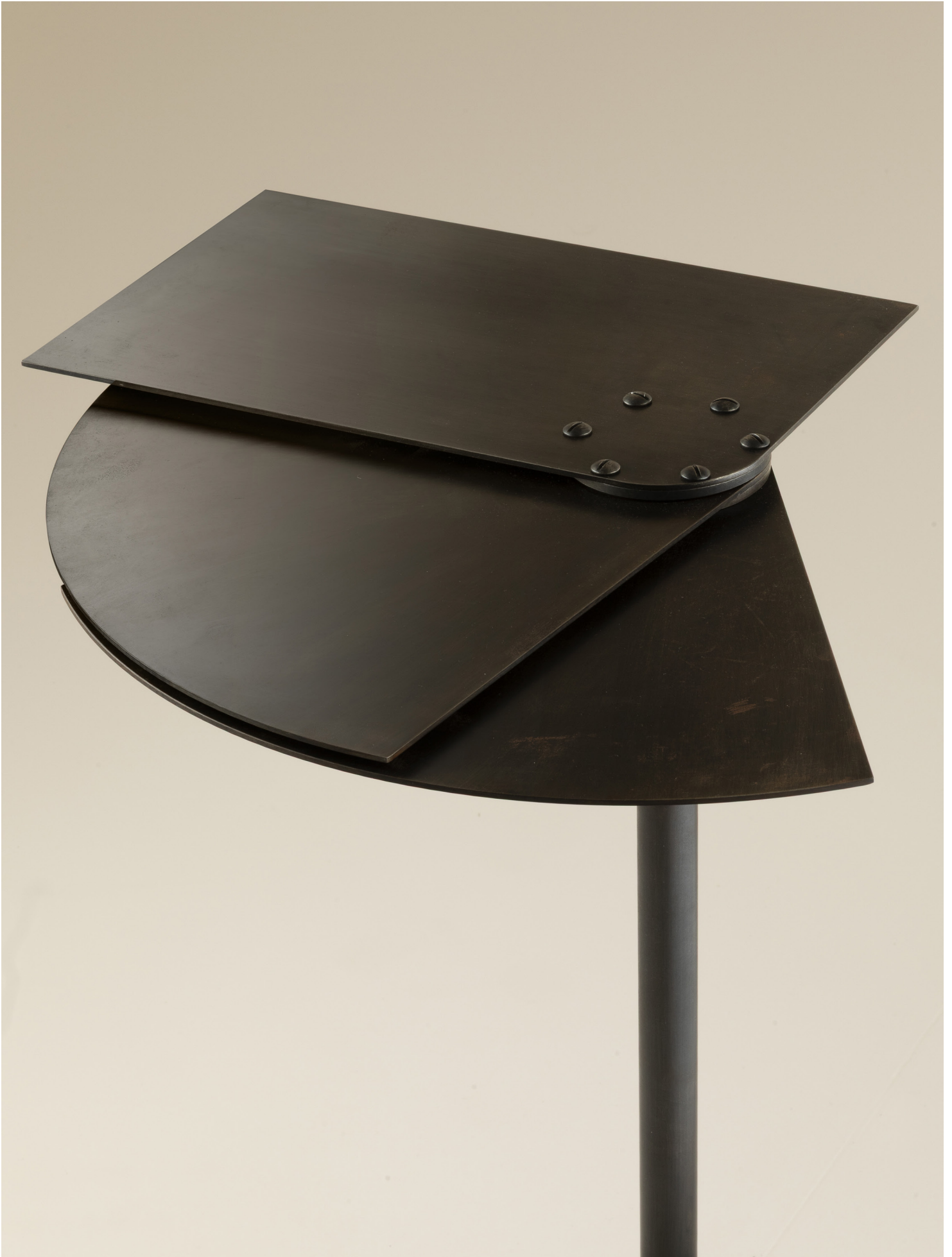
PIERRE CHAREAU (1888-1950)