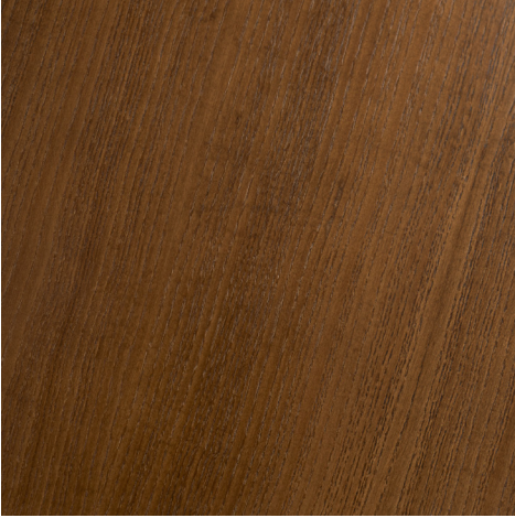
Smooth honey ash with matte varnish