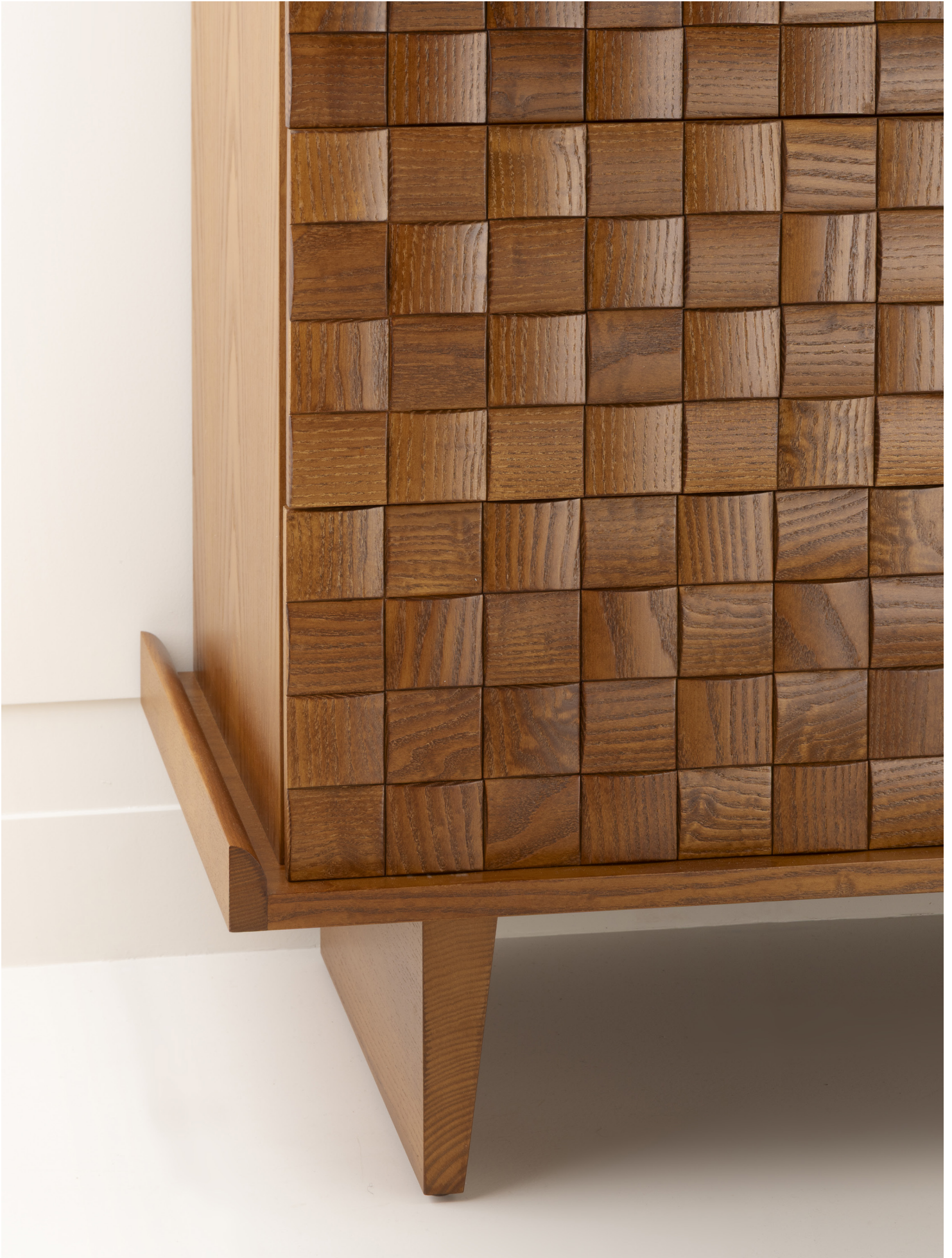
PAUL LÁSZLÓ (1900-1993)